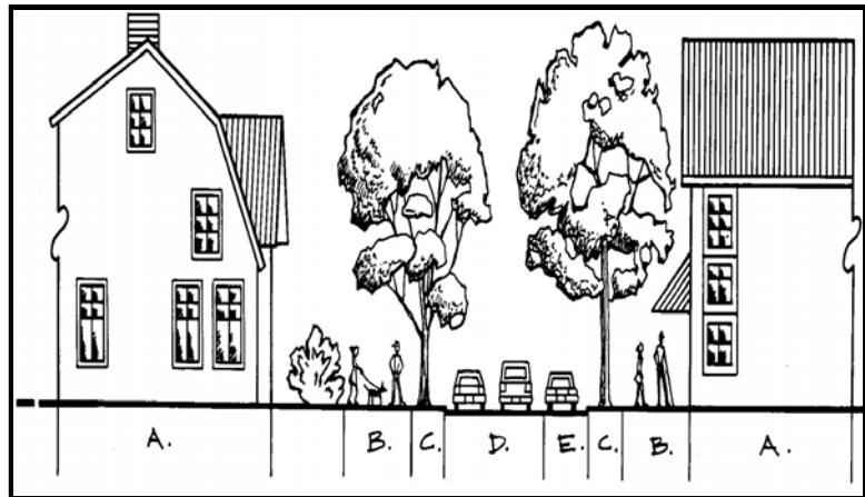
The elements of a streetscape include (A) buildings, which should be oriented toward the street and located to maintain consistent spacing and setbacks; (B) sidewalks; (C) planting areas for street trees; (D) the travel way of the street, which should be designed to slow traffic and maintain pedestrian safety; and (E) adequate space for on-street parking.

(3) Development shall be designed with an emphasis primarily on the street sidewalk and on pedestrian access to the site and building(s), rather than on auto access and parking areas. Buildings should generally be placed close to the street and their main entrances should be oriented to the street sidewalk. There should be windows or display cases along any building facades that face to street to provide interest to the streetscape. Development shall be designed so a person can comfortably walk from one location to another in a manner that encourages strolling, window shopping and other pedestrian activities. Development shall provide visually interesting and useful details such as benches, awnings and covered walkways, textured paving, shade trees and landscaping, trash bins, ornamental light fixtures, public clock or art, etc. Site and building design elements should be dimensionally smaller than those intended to accommodate automobile traffic. Examples include ornamental lighting no higher than 12 feet; bricks, pavers, or other paving modules with small dimensions; a variety of planting and landscaping materials; awnings or covered walkways that reduce the perception of the height of walls; signage and signpost details designed for viewing from a short distance.